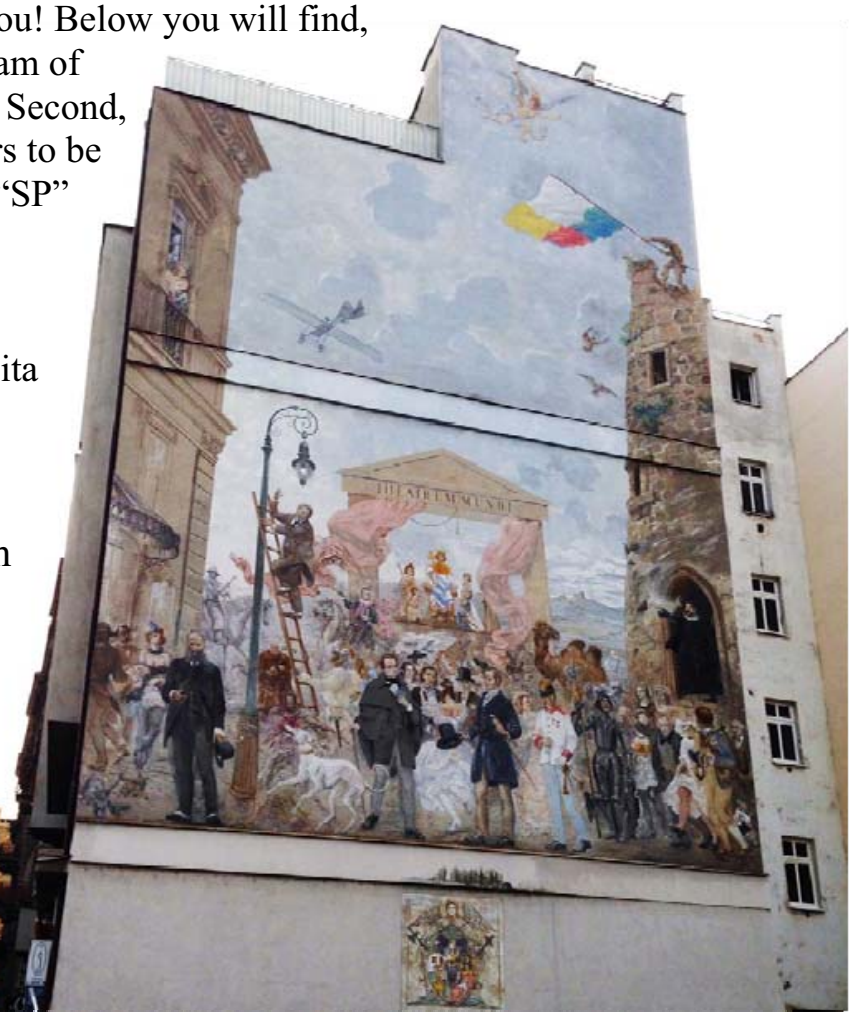
Theatro Mundi depicting famous citizens of Plzen, photo PH