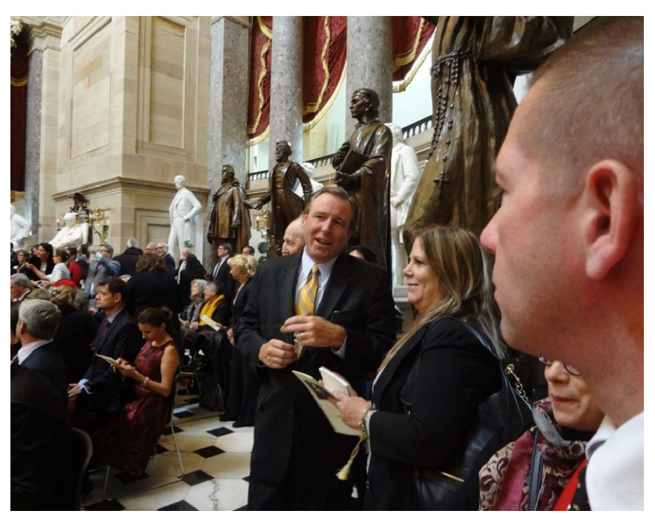
Statuary Hall, United States Capitol, 1 pm, Wednesday, November 19, 2014.

the feeling of coming from a small country, these young people feel that the planet belongs to them.