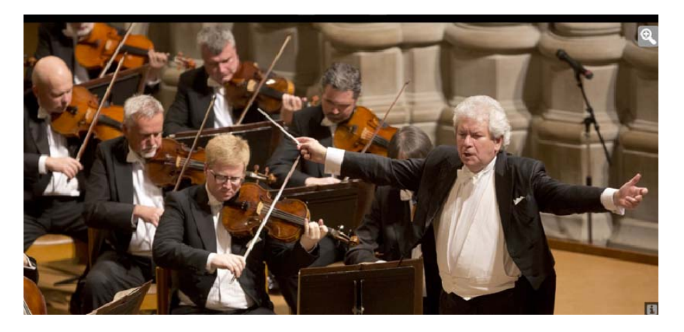
The Czech Philharmonic under the baton of Jiří Bělohlávek performs in the Washington National Cathedral.