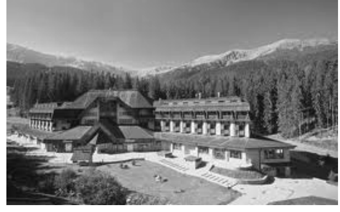
Demanova hotels: Grandhotel Jasna Demanova