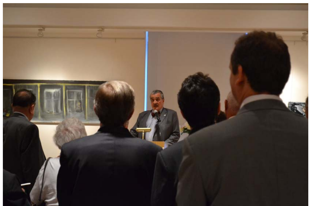
Minister Karel Schwarzenberg Addresses SVU Opening Reception