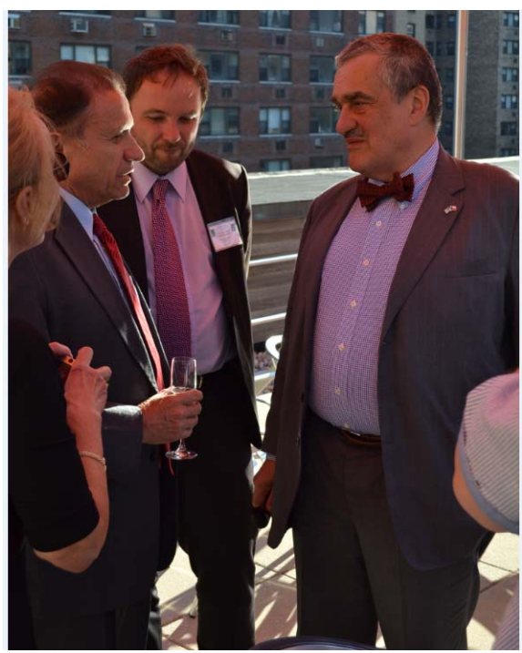
Minister Schwarzenberg Meets Meeting Participants