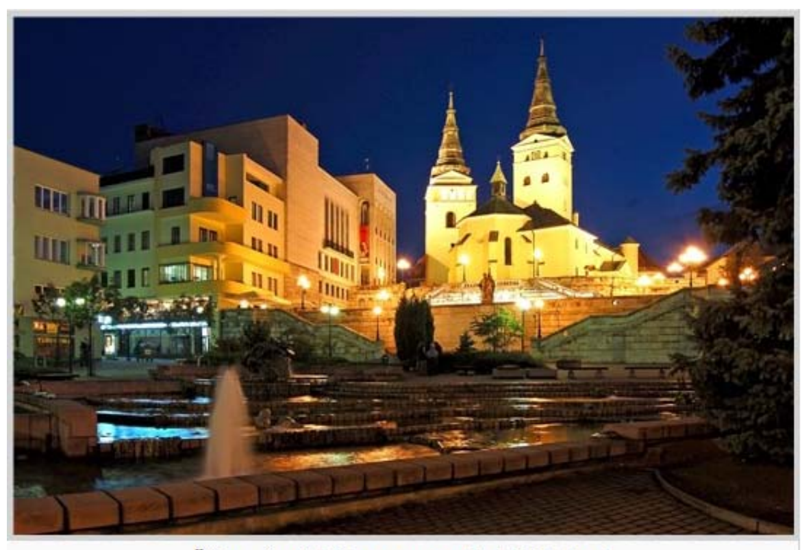
Žilina - nám. A. Hlinku square and the Parish church

ŽILINA has undergone dynamic growth since the establishment of the Slovak Republic in 1993. Of particular note is the investment of KIA Motors Slovakia. It is important to note that the town is not only an automobile production centre, but together with the Horné Považie region, it is also an interesting place for tourists. It is the seat of the University of Žilina , and since 2008 of the Žilina Bishopric . The popularity of the town as a centre of workshop and conference tourism has been growing too.