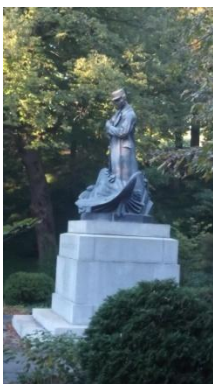
New statue of General Stefanik in the Slovak Garden.

Our chapter is dedicated to advancing the understanding of Czech and Slovak cultures by people of all background.