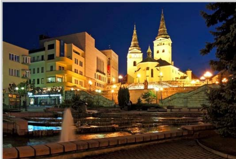
Žilina - nám. A. Hlinku square and the Parish church