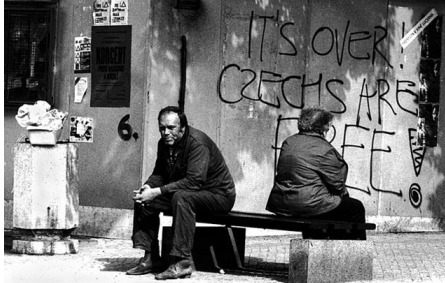
1990, It's over! Czechs are free!