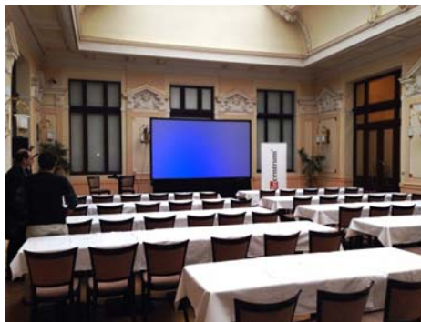
Měšťanská Beseda

Despite its long history as an industrial city, Plzeň has become a flourishing and prosperous center of culture and education in Western Bohemia. To its visitors, Plzeň offers many interesting historical monuments, a diverse and rich cultural life, fine examples of ancient and modern architecture to admire, quality accommodations to enjoy and good and fast transport connections with the Prague International Airport. Plzeň is the European Capital of Culture for 2015.