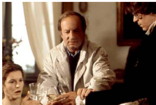
Ivan Passer's movie