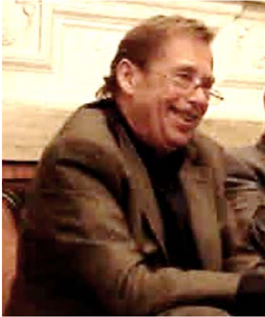
Václav Havel at the Czech Embassy in Washington, DC.