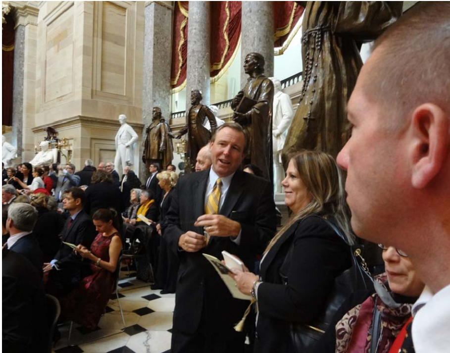
Statuary Hall, United States Capitol, 1 pm, Wednesday, November 19, 2014.