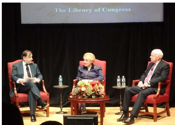
Michael Žantovský, Madelaine Albright and John McCain at a public discussion in the Library of Congress in November 2014.

Twenty-five years ago, in November and December 1989, many people joined together in Czechoslovakia to make the Velvet Revolution. They acted and they spoke, in the streets and in