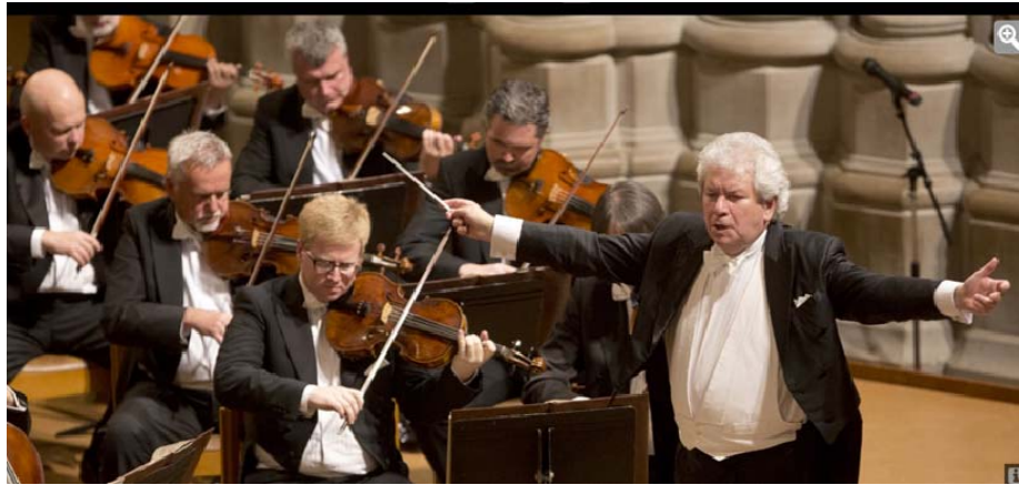
The Czech Philharmonic under the baton of Jiří Bělohlávek performs in the Washington National Cathedral.