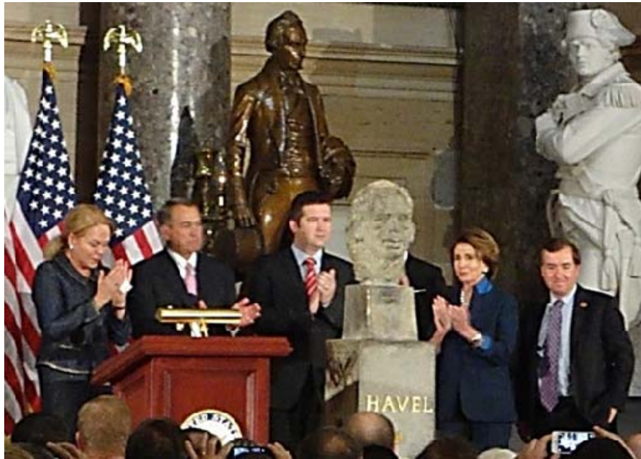
Dagmar Havlová, the speaker of the House John Boehner, Jan Hamáček, Bohuslav Sobotka (hidden), the speaker of the Senate Nancy Pelosi.