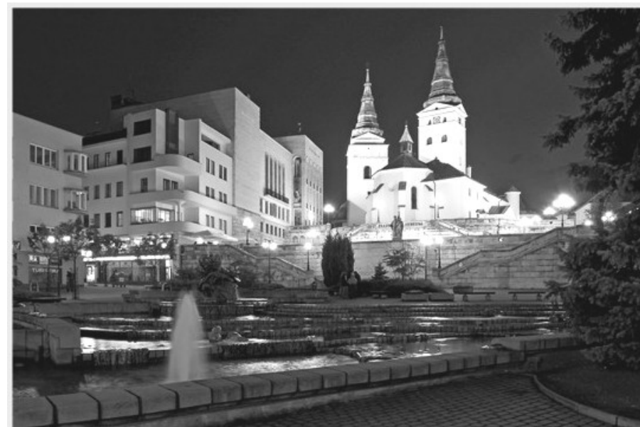
Žilina - nám. A. Hlinku square and the Parish church

ŽILINA has undergone dynamic growth since the establishment of the Slovak Republic in 1993. Of particular note is the investment of KIA Motors Slovakia. It is important to note that the town is not only an automobile production centre, but together with the Horné Považie region, it is also an interesting place for tourists. It is the seat of the University of Žilina , and since 2008 of the Žilina Bishopric . The popularity of the town as a centre of workshop and conference tourism has been growing too.