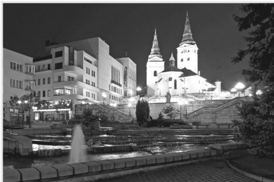
Žilina - nám. A. Hlinku square and the Parish church