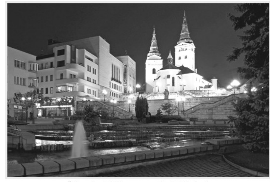
Žilina - nám. A. Hlinku square and the Parish church

There will also be a pre-Congress opportunity to participate in a two-day Wine Tasting Tour of the Wineries at Modra ($99 €uro plus hotel expenses). For further information please see: www.svu2000.org